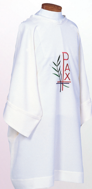
D868 ..... $179.00