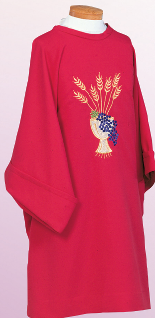
D25 ..... $209.00