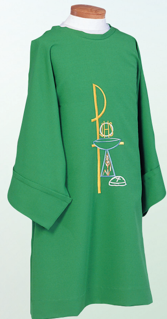
D855 ..... $217.00

DESIGNS DEPICTED, AVAILABLE IN ALL COLORS.