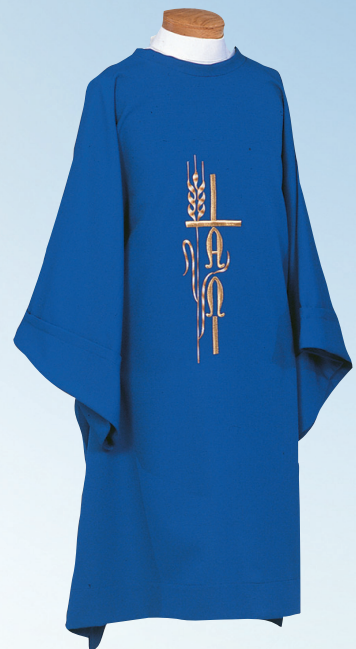
D850 ..... $219.00