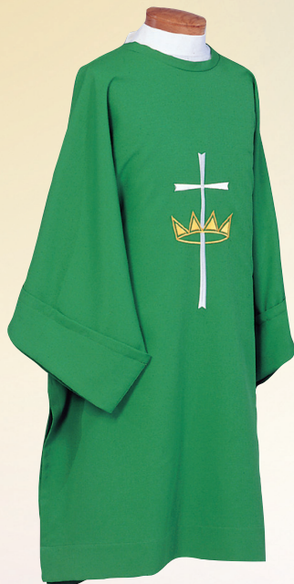
D842 ..... $179.00