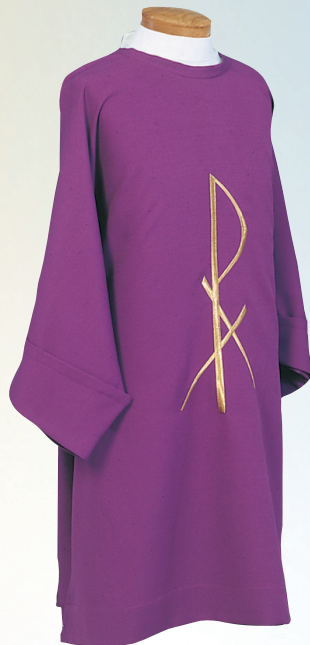
D852 ..... $196.00